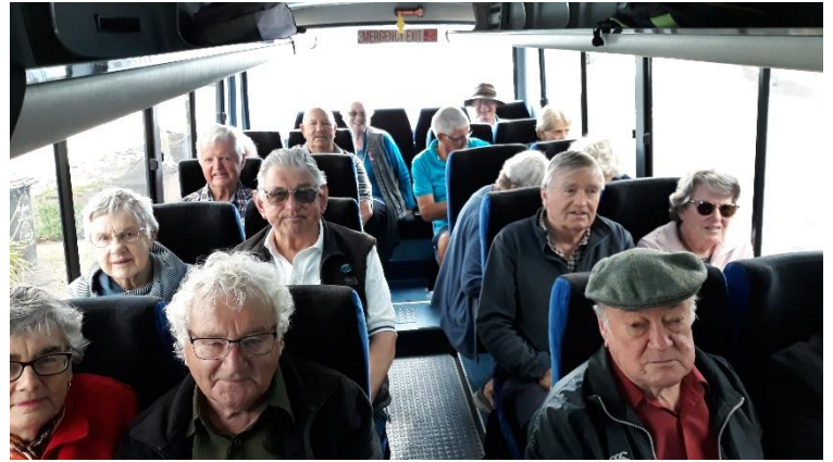
Some photos from our recent bus trip to the Saffron Farm at Ettrick.