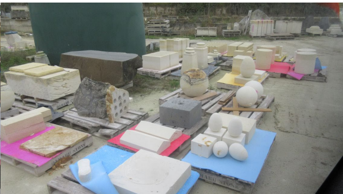
Examples of what their machinery can do