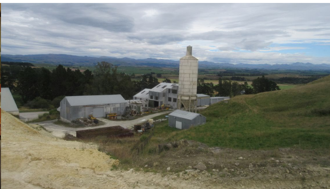
Weston limeworks Crushing and load out area