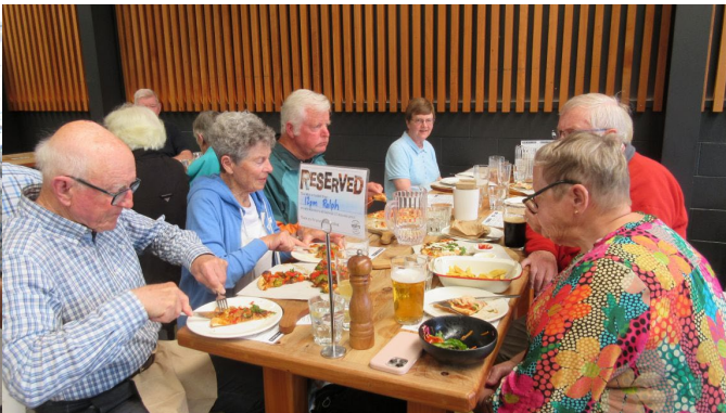
Lunch in Oamaru