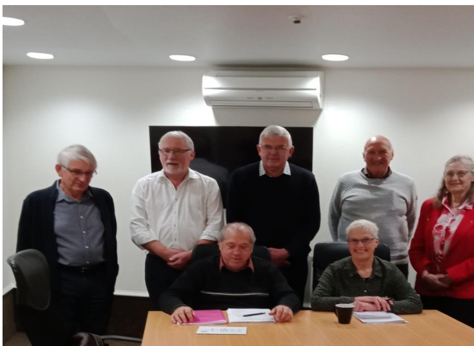
2020/21 Board Members and Executive Officer