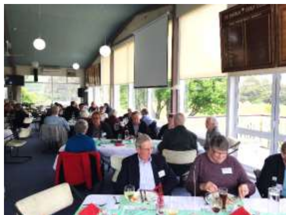
Members at the Christmas function at Te Marua Golf Club on 21 November 2018

The finances of the Branch continue to strengthen and as at 31 March 2019, a significant surplus was recorded for the year. The two main contributors to this were; the centralization of printing and mailout of the two newsletters saving the branch over $3000, and that, combined with a rise in the return from member subscription, meant the Branch's surplus rose above that recorded in the previous year. As a result it was decided to subsidise the meals for the 2019 AGM and the Wairarapa function, our two business meetings in the year.