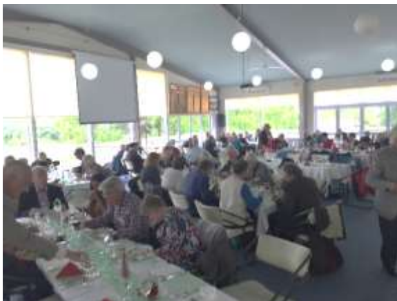
Members enjoyed the Christmas Function at Te Marua Golf Club on 21 November 2018.

Masterton Club on the 27 September attended by 40 members. Only a small number attended the Light Lunch on 24 June at Anvil House and subsequently it was decided to discontinue this meeting. The Christmas Function was held at Te Marua Golf Club on 22 November and attended by 78 members. We were entertained by Scarlet, the duo singer and guitarist, and the event nicely rounded out the year.